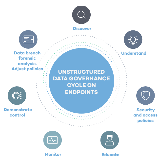
Figure 2 - Phases of the continuous improvement process to ensure data governance, and Panda Data Control's contribution to reduce costs and efforts.

Panda Data Control's dashboards and predefined reports and alerts help to cover use cases and ensure security governance of the unstructured personal data held on the organization's protected devices.